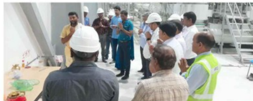
BANGLADESH INDIA FRIENDSHIP POWER CORPORATION LIMITED(BIFPCL) - RAMPAL, BAGERHAT, BANGLADESH