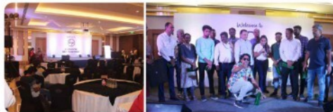
On September 22, 2023, VHRS organized an Employee Get-together Event for LAT at the Radisson Blu, St. Thomas Mount.