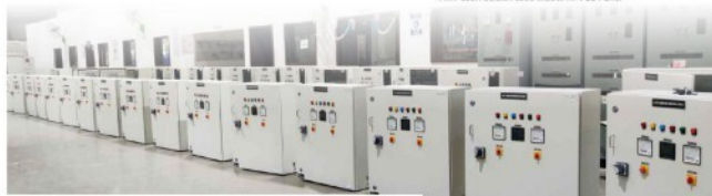
M/s. Universal MEP - RDSS Project @ Jabalpur and Gwalior - AC Distribution Board