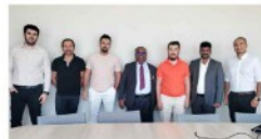
M/s. Yapi Merkezi