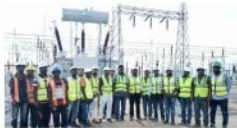
KEC - Dapaong and Mandouri S.S of Togo