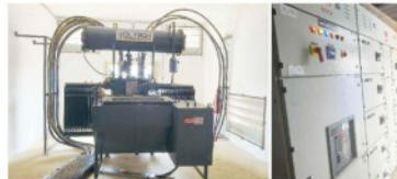
Sonata Cashew - Ivory Coast