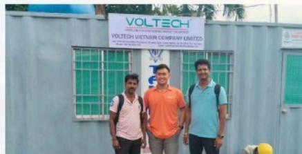
Voltech Vietnam Site office of Olam Global Agri Vietnam Co. Ltd