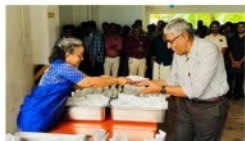
Distribution of Sweets to Employees