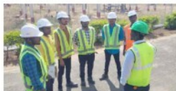
Siemens Gamesa - Ram Nagar 110kv/23kv Substation