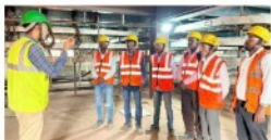
Vedanta - Langgarh