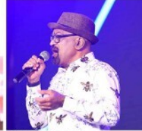
Post Lunch Performance by MD's Batch Mate