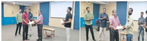
CMRL - CHENNAI