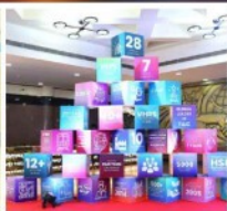
Voltech 28 Years of Journey