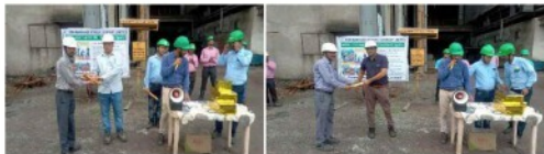
KSK - AKALITARA