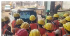
Vedanta - Langgarh