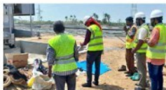
Inauguration of Erection work - M/s. TATA Projects - 225kv Koukoulou Sub station - Mali