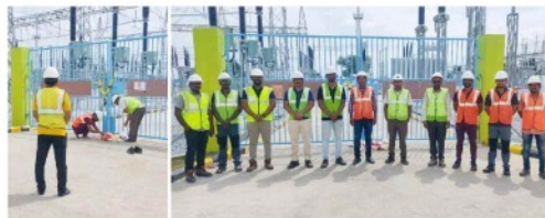
SIEMENS GAMESA RENEWABLE POWER PRIVATE LIMITED (AYANA) - GADAG, KARNATAKA