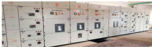
Alcott - Ivorycoast