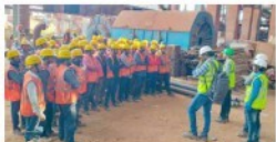
Vedanta - Langgarh