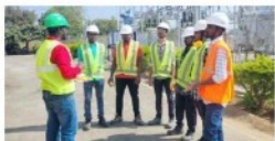
Siemens Gamesa - Ram Nagar 110kv/23kv Substation