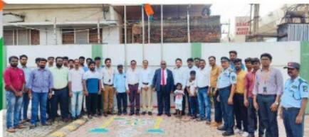
Employees gathered for the flag hoisting