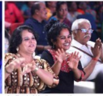
Families cherishing the moment in Anniversary Celebration