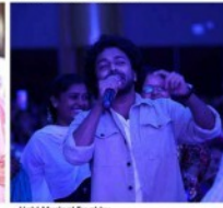
Light Musical Treat by Jeevan Padmakumar - ZEE Tamil