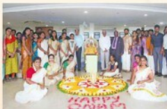
Employees gathered for the Onam Celebration