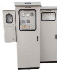
M/s. Transglobal Pvt. Ltd. - 11KV outdoor RMG Panel (1VCB + 1LS) @ Marimalai Nagar Substation