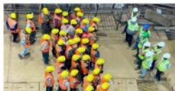
Vedanta - Langgarh