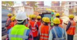
Vedanta - Langgarh