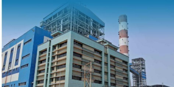
Biennial Mega contract for Electrical and C&I of 2X800 MW Thermal Power Plant at NTPC, TELANGANA

Scope of work: Annual Maintenance Contract(AMC) of 66KV Equipment and Associated Accessories of Receiving Sub Stations.