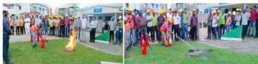
NTPC - KARANPURA