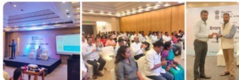
On November 15, 2023, VHRS organized a POE Conference Meeting for Ministry of External Affairs at the Hotel Trident, Chennai.