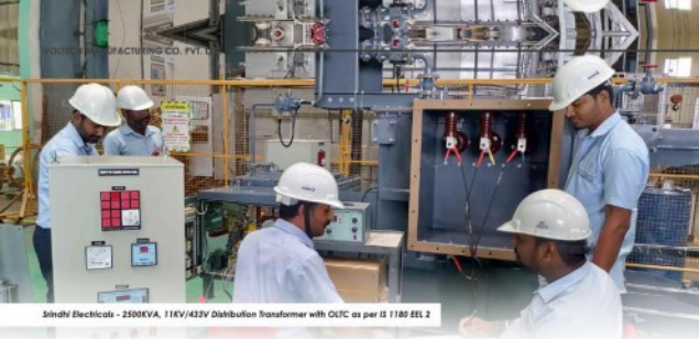
Sindhi Electrotech - 2500KVA, 11KV/433V Distribution Transformer with OLTC as per IS 1180 EEL 2