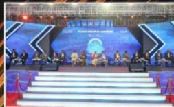
28th Anniversary Stage revealing