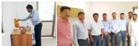
JINDAL POWER LIMITED – DHULE, MAHARASHTRA