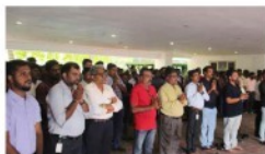
Employees assembled for the Pooja