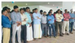
Employees assembled for the Pooja

Song & Mimicry Performance By Voltech Employees