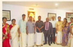
M.D Sir's Presence for the Onam Celebration