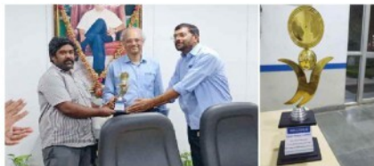
JASAN POWER (Madhya Pradesh) – VOMS team got Best Safety Performance Award for the Month of Sep '23