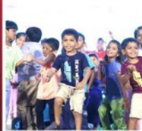
Young champs enjoyment on the Anniversary Celebration