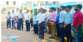
Voltech Team paying Homage to the tri-color

The Independence Day was celebrated with great enthusiasm by all the employees of Voltech group and winded up the celebration by singing National Anthem.