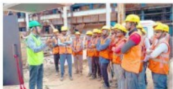
Vedanta - Langgarh