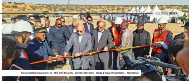
Commissioning Ceremony of - M/s. KPEL Projects - 225/90/33kv Beni - Nadji & Tiguent Substation - Mauritania