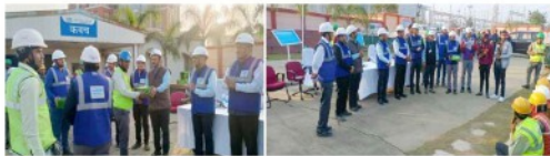
NTPC - KARANPURA