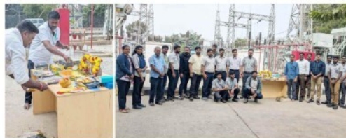
BANGALORE METRO RAIL CORPORATION LIMITED – BANGALORE, KARNATAKA