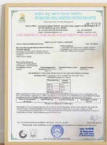
NSIC Certificate Successfully Received