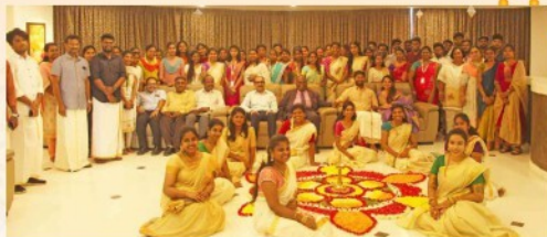
Glimpse of Voltech Group for Onam Celebration