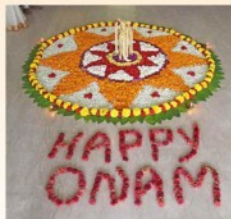
The fervour of making Pookkalam was set of Voltech Head Office

Making Pookkalam was set in at Voltech Head Office