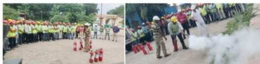
NTPC - TELANGANA